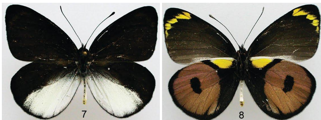
Figs 1-2. Delias maaikae spec.nov. holotype ♂, Cyclops Mts., Papua, Indonesia, coll. MZB: fig. 1. dorso; fig. 2. verso. Figs 3-4. Delias bornemanni ♂, Owgarra, Owen Stanley Range, PNG, coll. NHM(UK): fig. 3. dorso; fig. 4. verso. Figs 5-6. Delias nais nais ♂, Bilogai, Paniai region, Papua, Indonesia, coll. KSP: fig. 5. dorso; fig. 6. verso. Figs 7-8. Delias pratti ♂, Menyambu, Arfak Mts, Papua Barat, Indonesia, coll. KSP: fig. 7. dorso; fig. 8. verso.