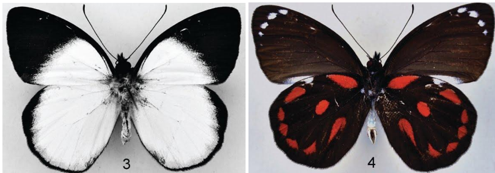
Figs 3 & 4