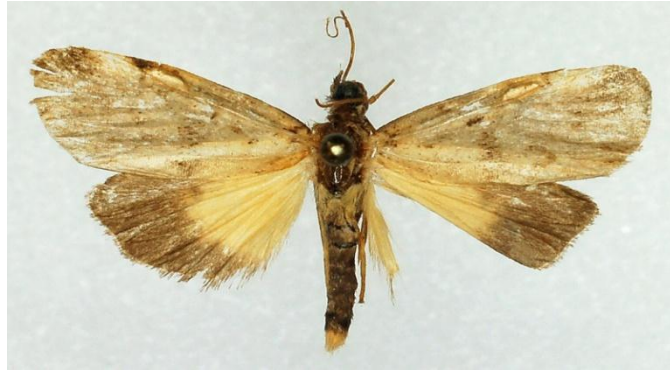
Fig. 1. Cyana devriesi spec. nov. , holotype ♂, Boma, Kombai-Auyu region, Papua, Indonesia (RMNH)