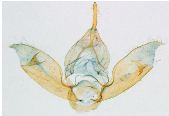
Fig. 2. Cyana devriesi spec. nov. , ♂ genital armature (prep. RV1626)