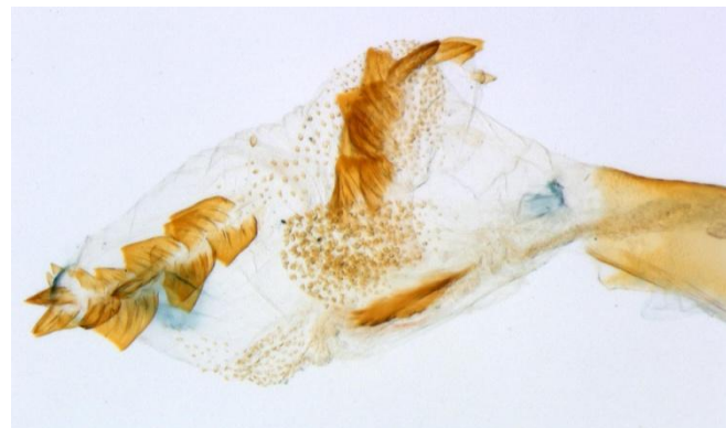
Fig. 4. Cyana devriesi spec. nov. , detail of vesica with cornuti (prep. RV1626)